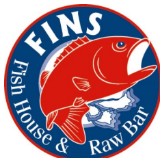
Rehoboth Beach, DE