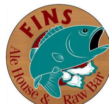
Bethany Beach, DE