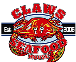
Rehoboth Beach, DE

Find Big Oyster Beer on Tap at all Fins Hospitality Group locations