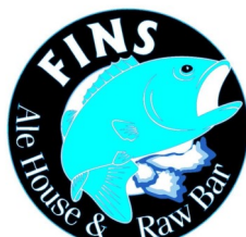
Rehoboth Beach, DE